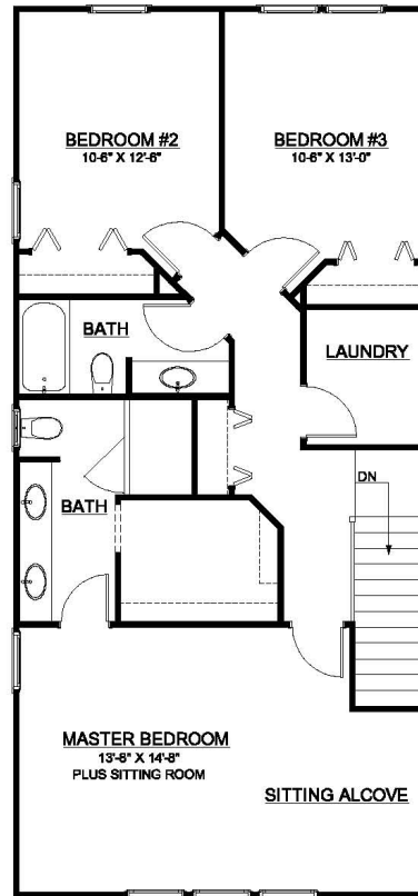
2ND FLOOR - 1045 SF