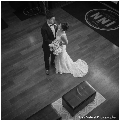
Hey Sisters! Photography